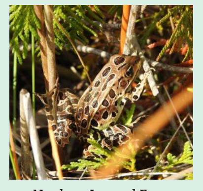
Northern Leopard Frog