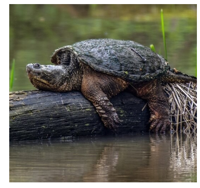
Common Snapping Turtle