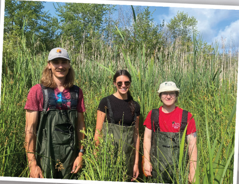
Exciting Upcoming Events!