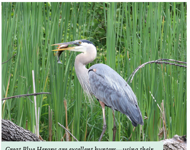
Great Blue Herons are excellent hunters—using their long beaks to catch prey underwater. This Heron has caught fish for dinner!

As we get into the fall weather this month, the colours will begin to change. The marsh looks beautiful lined by oranges, yellows, and reds in the trees—but hopefully we have a few weeks of sunshine yet!