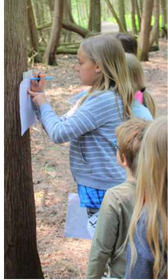
Wye Marsh 16160 Hwy #12, P.O. Box 100 Midland, Ontario L4R 4K6