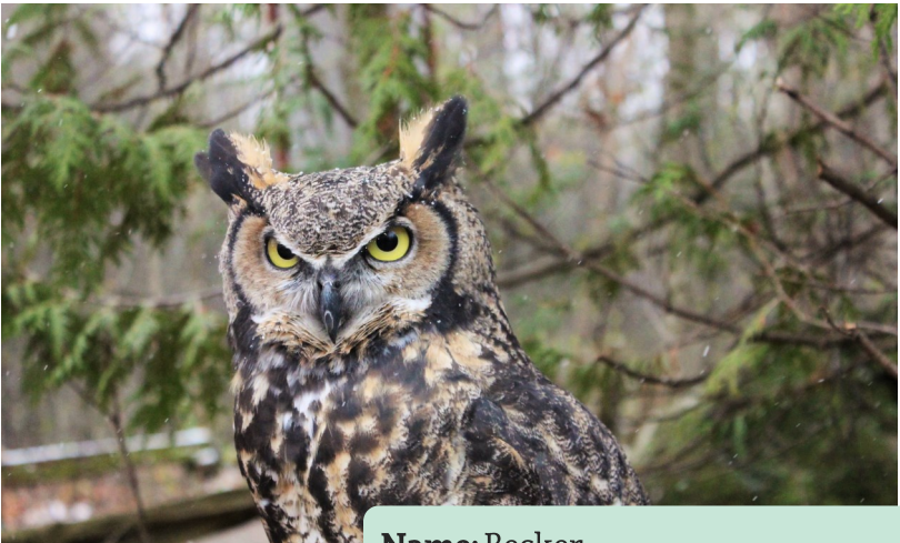
Name: Becker Species: Great Horned Owl Likes: Hooting at Visitors Dislikes: When you don't hoot back!

December also marks the Christmas Bird Count and the Christmas Bird Count for Kids as many winter species are back in the area. The Christmas Bird Counts are one of the largest citizen science projects across the globe with thousands of birders reporting their sightings. These sightings are reported to eBird and Bird Studies Canada and help monitor bird populations world wide. Normally Wye Marsh hosts bird counts for both of these events—however this year we are instead encouraging you to get out and bird on your favorite hiking trail or location (maybe even at Wye Marsh!). More info about the Christmas Bird Count can be found at <u>BirdsCanada.org</u>. The 2020 Christmas Bird Count for Kids Tally Sheet is on page 7 of this newsletter.