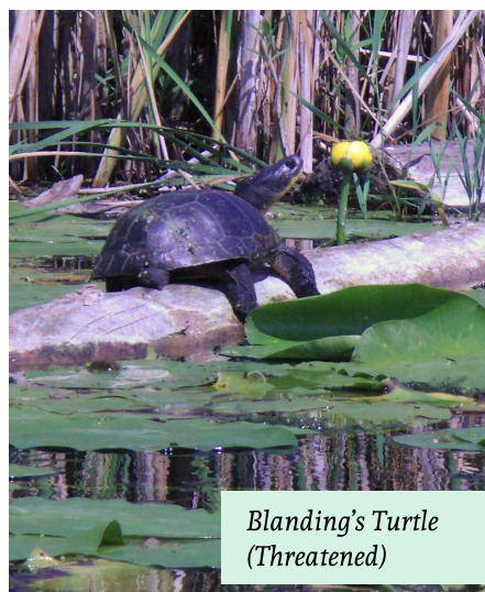
Blanding's Turtle (Threatened)