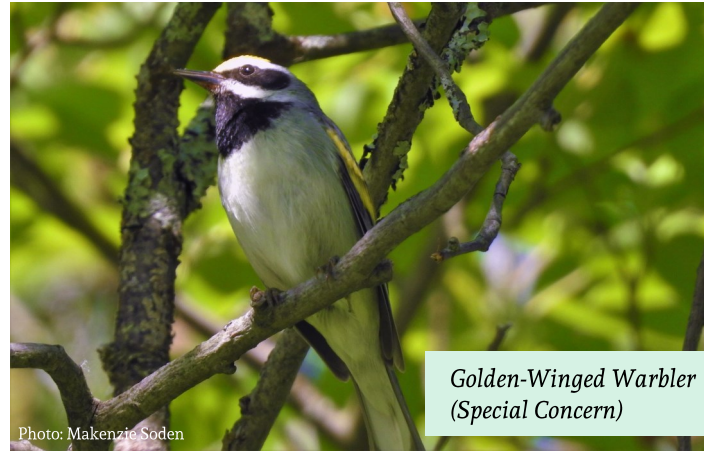
Golden-Winged Warbler (Special Concern)

Extirpated - species lives somewhere in the world, and at one time lived in the wild in Ontario, but no longer does.