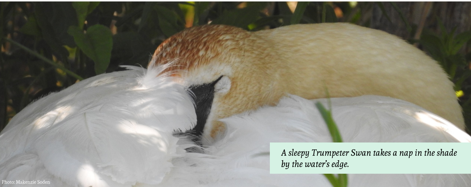
A sleepy Trumpeter Swan takes a nap in the shade by the water's edge.