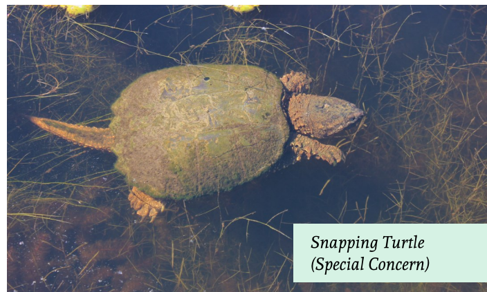
Snapping Turtle (Special Concern)