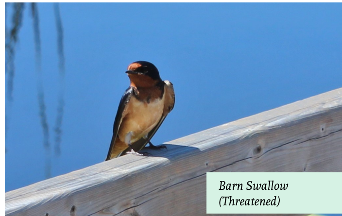
Barn Swallow (Threatened)