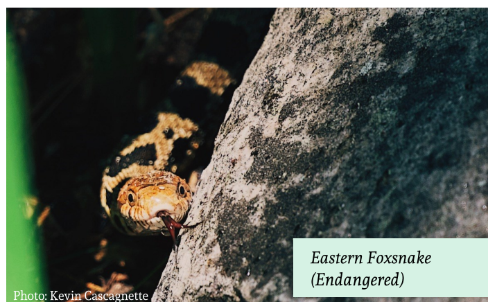
Eastern Foxsnake (Endangered)