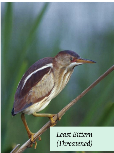
Least Bittern (Threatened)