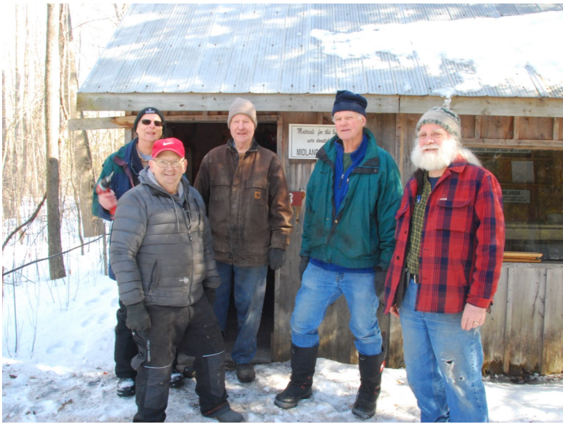
Members of Wye Marsh Sap Sucker Team in front of the Sugar Shack, photo by Sap Sucker Member Allan Mantel (not pictured).

The Sap Sucker Team are volunteers who operate the Wye Marsh Sugar Shack—right from tapping the maple trees, all the way through collection, evaporation, to maple syrup!